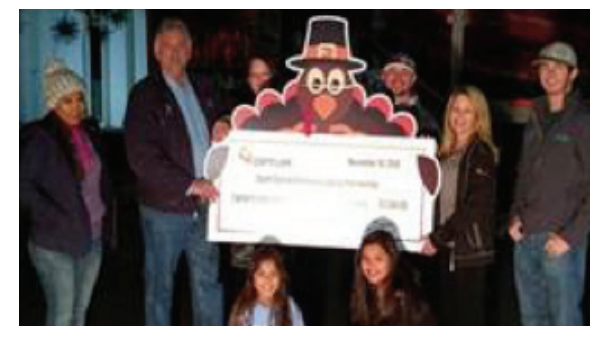
Donation to the S. Central Community Action Partnership