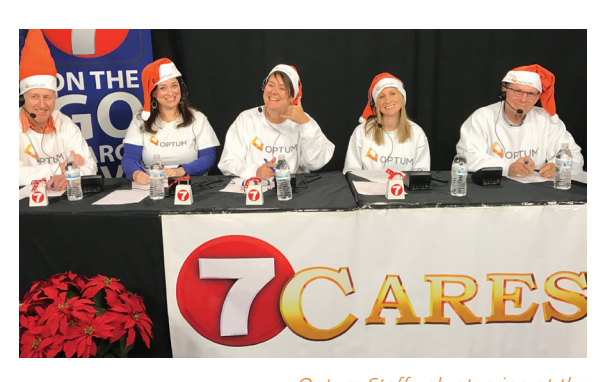
Optum Staff volunteering at the phone bank for 7Cares Idaho Shares