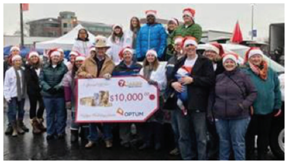
7Cares Idaho Shares day in Boise, Idaho