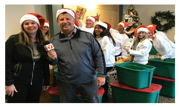
Live Broadcast at the Optum Office for 7Cares Idaho Shares