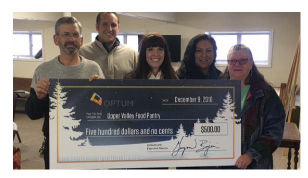
Donation to the Upper Valley Food Pantry in Saint Anthony, ID.