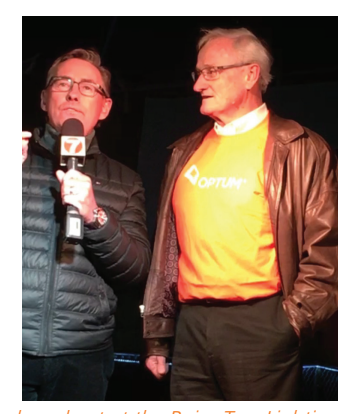
Live broadcast at the Boise Tree Lighting Celebration for 7Cares Idaho Shares